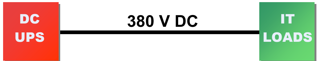
Figure 1d represents a hypothetical approach distributing 380 V DC. IT devices designed to operate from 380 V DC would need to exist in order for this approach to work.

Hypothetical approach for distributing 380 V DC