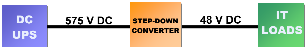
Figure 1e represents a hypothetical hybrid 575 V DC system. This system utilizes IT devices designed to operate from 48 V DC, but uses a 575 V DC UPS and an intermediate 575 V DC to 48 V DC step-down converter. It combines some of the attributes of Figure 1c and Figure 1d .