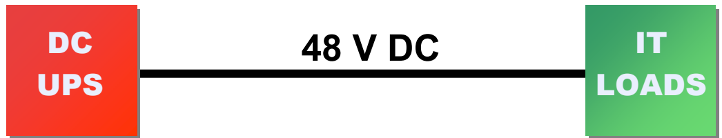
Figure 1c represents typical telecom DC power distribution. A DC UPS provides 48 V DC for distribution to the DC powered IT loads.